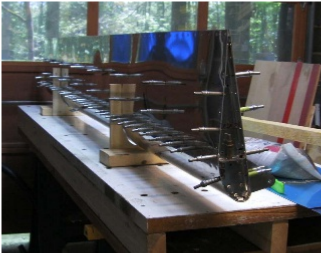
Left flap clecoed, waiting for me to get back to work!