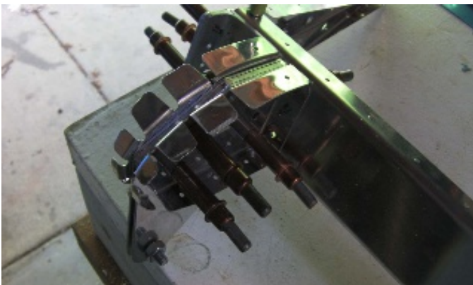
Flap Attach Bracket on the spar.

Continuing with my flaps, Make FL-906A-L & R angle brackets and spacers. Run to Henards for some 2x4 lumber to raise the table. Remove plastic from all parts, Debur all the FL-907 hinge bracket components and cleco to the nose ribs. Cleco the assembly to the spar. Cleco the outboard rib to the spar, cleco the FL-906B-L plate to the rib. Place the FL-906C spacer and the FL-906b-L angle and clamp to the FL-906B-l plate. I used a clamp to also clamp it to the spar. Drill all the holes in all components.