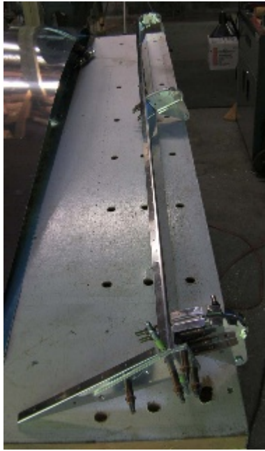
Left flap spar with brackets.