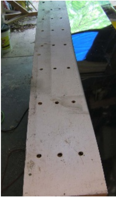
Holes drilled in table/door.

Insert the FL-909 trailing edge, using the same as a spacer. I taped the FL-909 to the bottom skin to keep it from moving. I also had extra so I did not need to use the one for the right flap.